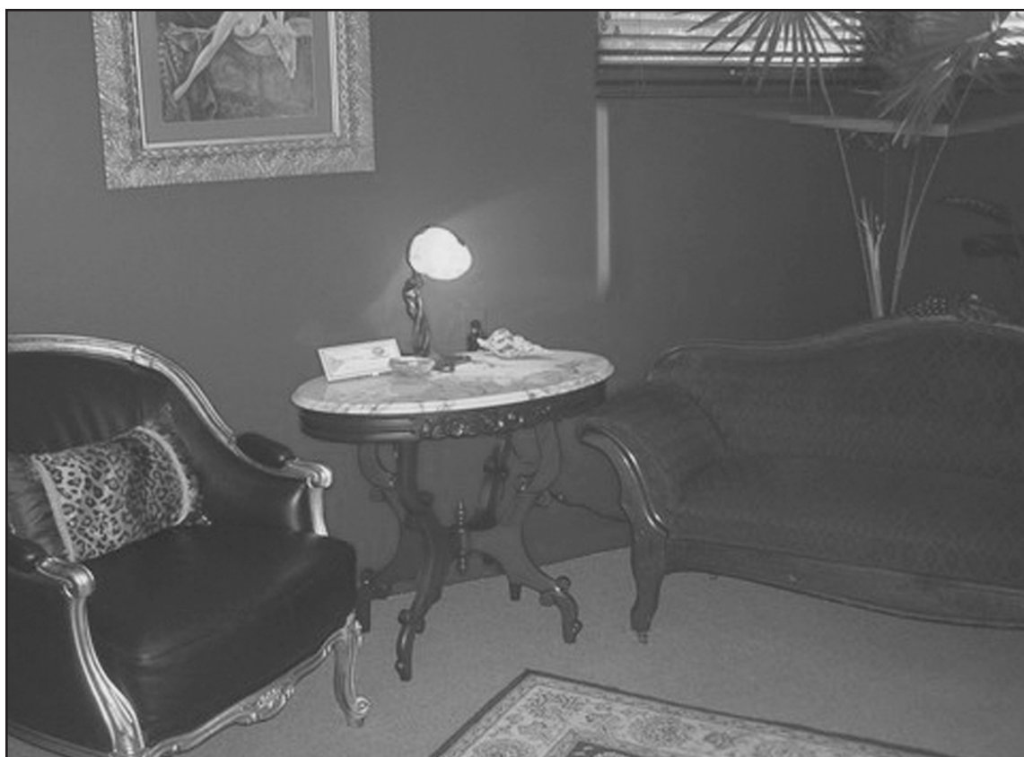
The waiting room of Jersey Shore Electrolysis is designed to provide a relaxing environment before any procedure is undertaken.

Electrolysis is a permanent solution to an embarrassing problem.